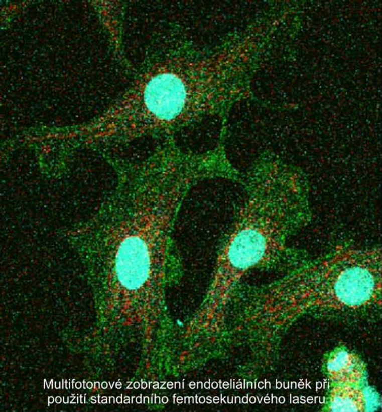
Multifotonové zobrazení endoteliálních buněk při použití standardního femtosekundového laseru