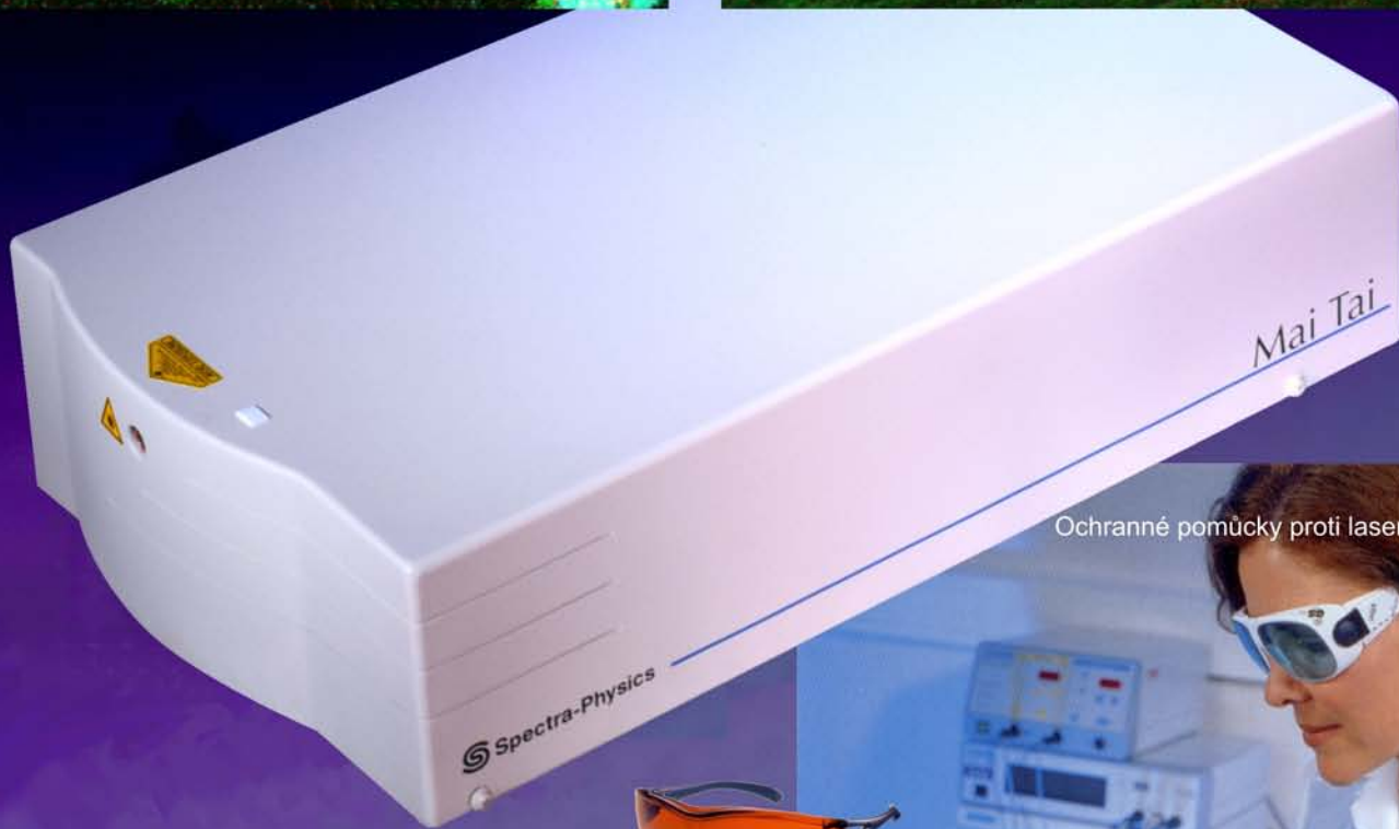
Ochranné pomůcky proti laserovému záření