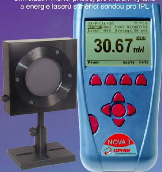
Univerzální měřicí přístroj pro měření výkonu a energie laserů s měřicí sondou pro IPL